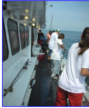
Donor support enabled our kids to experience their first ever chartered fishing trip this past summer at the Jersey shore. Thank You!